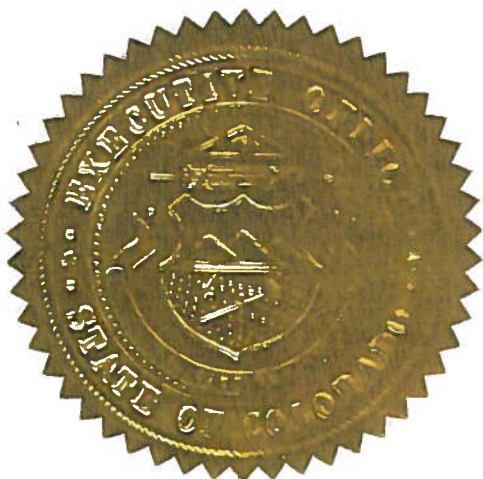
John Hickenlooper Governor

A handwritten signature in black ink that reads "John Hickenlooper".